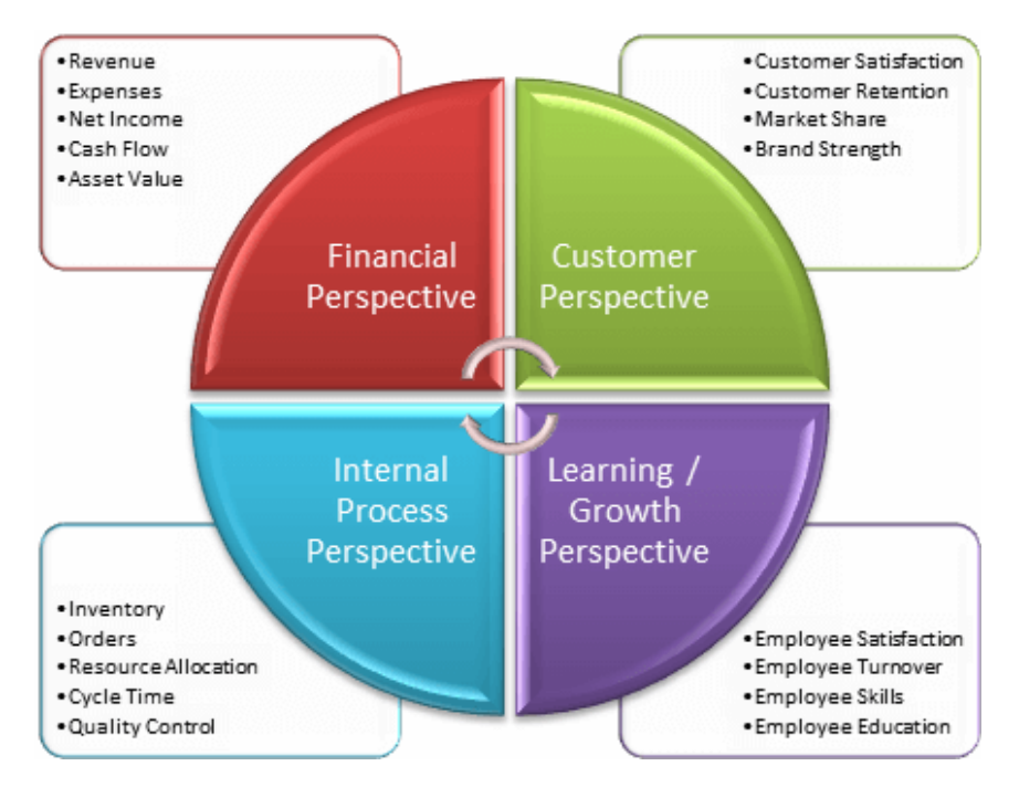
Fig 2: A few examples of KPIs used to evaluate productivity in each angle are provided below.