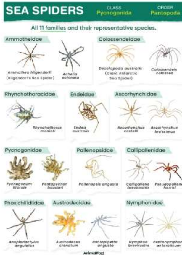
Fig. 2. Sea Spider classification

The majority of published research has predominantly concentrated on the taxonomy and general biology of Pycnogonida. However, recent contributions by researchers such as (Mercier & Hamel, 1994), (C. Arango & Brodie, 2003), (Sherwood, Walls, & Ritz, 1998), (C. Arango, 2001) have yielded novel insights into the ecology of specific species. In contrast, the phylogenetic relationships within Pycnogonida remain inadequately explored. (Hedgpeth JW, 1947) established a classification system grounded in traditional morphological distinctions. Most students of the group currently accept and follow this classification, which continues to be widely accepted by contemporary scholars, with minimal modifications. This classification is underpinned by a hypothesis proposing a reduction series in the number of segments as an evolutionary trend associated with the loss of appendages (Hedgpeth JW, 1947); (Jan H. Stock, 1994). While this hypothesis has provided a straightforward explanation for the phylogenetic framework of the group, it is imperative to develop methodologies that can rigorously test this taxonomic assertion. Current analytical techniques for morphological and molecular data present an opportunity to rigorously evaluate the hypothesis of gradual reduction and to explore alternative narratives regarding the evolutionary history of sea spiders.